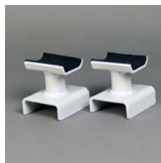
Custom Lifting Adapters Available