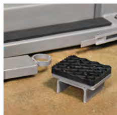
Standard Adapter, Optional Adapters Are Available