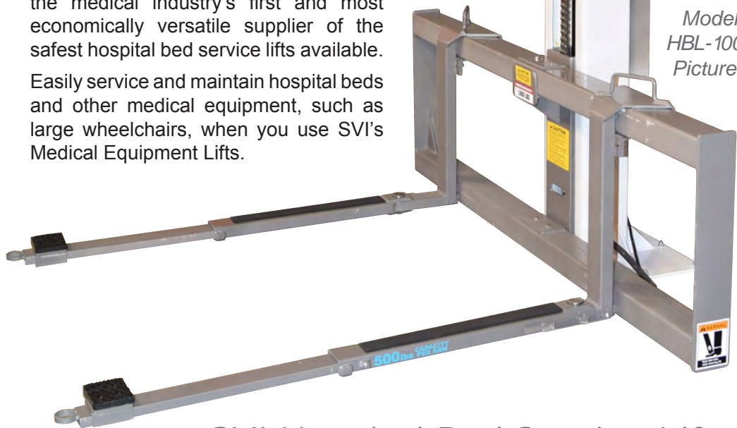
Model HBL-1000 Pictured