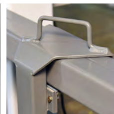
Handle for Lift Width Adjustment

Low-Profile Lift Arms are only 2-3/16" tall for ease of lifting virtually any hospital bed.